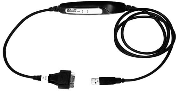
CG150 CAN/USB Gateway Interface Communicator

The CG150 is compatible with Bosch CAN standard 2.0 A & B (standard and extended data frames) and USB standard 1.1 & 2.0.